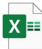
申し込み用紙 (Application Form)